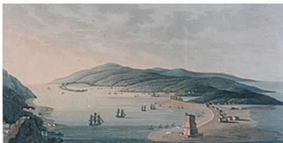
Figure 7. John Curtis (1812), View of the Straits of Messina, Aquatint. Rome, Private Collection.

The authors are grateful to the technical