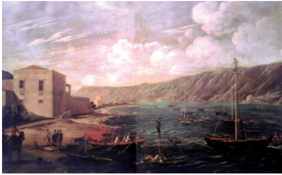
Figure 4. A. Casembrot (1644), A view of the Straits of Messina , oil on canvas. Naples, National Museum of S. Martino.