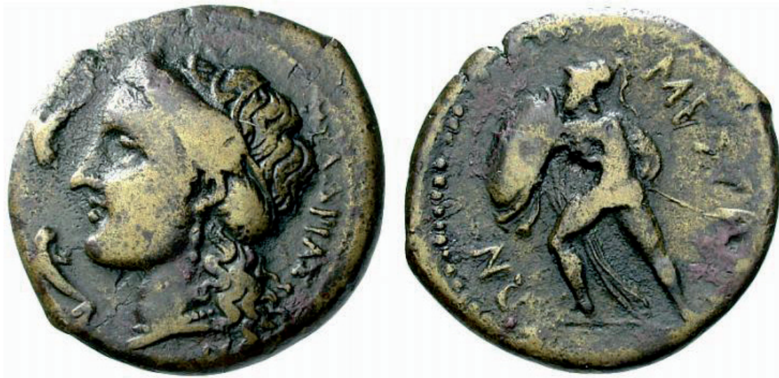
Figure 2. Ancient coin depicting the Goddess Peloria ( http://pheraimon.blogspot.com/2007/11/peloro-e-laninfa-pelorias.html ).

continental sand was at the initial stage of accumulation.