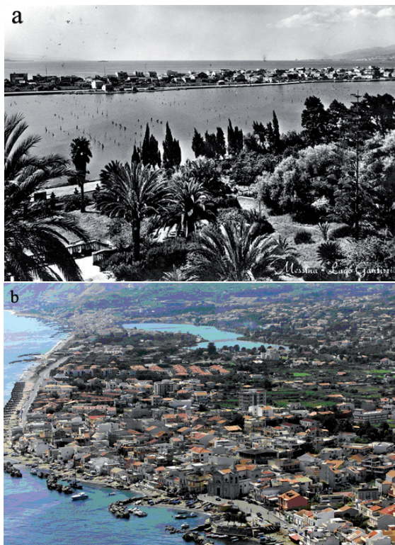
Figure 6. Ganzirri area before (a) and after (b) wild speculation.

account for this sharp prow, mocking beak of this "beast" who always sail, the blue, sometimes peaceful, Thalassa, the "Mare Nostrum", between the roar of Scylla, and the mighty bellowing of Charybdis (Chillemi, 1995).