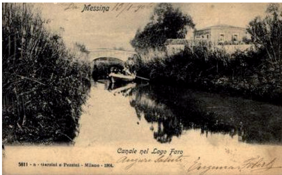
Figure 5. View Villa Pomara - postcard from the early 1900.

Later, monitoring has been made on the hygienic conditions of the lakes of Faro and Ganzirri (Ciaccio, 1983; Delia et al. , 1984; Giacobbe et al. , 1996), on spread of Hepatitis A (Di Pietro et al. , 1987) and on environmental quality (Cortese et al. , 2000; Bergamasco et al. , 2005; Mazzola et al. , 2010). Faro lake, however, is still largely exploited for bivalve cultivation (mainly Mytilus sp.; Giacobbe et al. , 1996, Canestri Trotti et al. , 1998; Licata et al. , 2003; Licata et al. , 2004), with an estimated mean annual cultivated biomass of ~300 t.