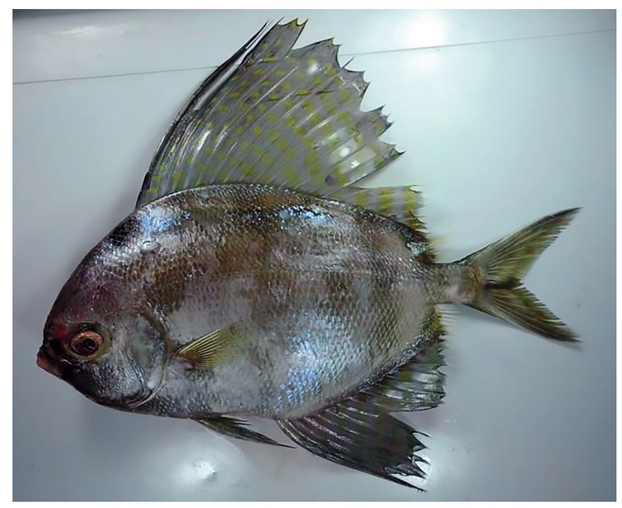
Fig. 2 - Velifer hypselopterus, 430 mm total length collected from the coast of Al-Askhara City, Arabian Sea coast of Oman.

The specimen of V. hypselopterus is identical based on the description of this species given by RANDALL (1995) and HOESE et al. (2006) (Fig. 2).