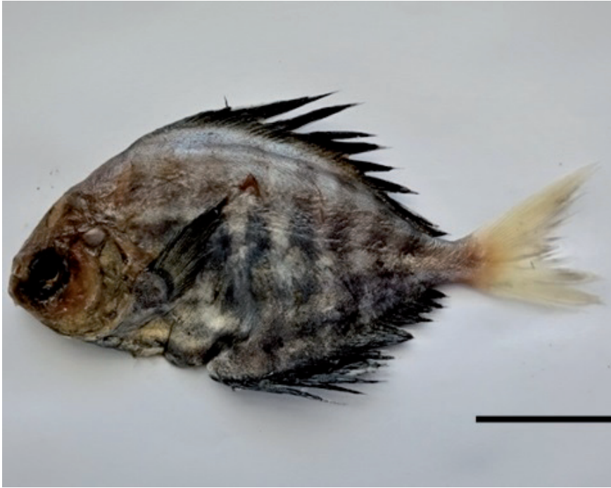
Figure 2. Specimen of Uraspis secunda collected off the Senegalese coast (ref. ISPAB-Ura-Sec-01), scale bar = 30 mm.

The description of the specimens in the present paper, follows BELLO et al. (2014)'s protocol recommended for first records. Measurements were recorded to the nearest mm and total body weight to the nearest g, together with meristic counts, such as number of rays for each fin and number of gill rakers (Table 1). The specimen was fixed in 10% buffered formaldehyde, preserved in 75% ethanol and deposited in the Ichthyological Collection of the Institut Supérieur d'Acquaculture et de Pêche of Bizerte (ISPAB), Tunisia, and received the catalogue number ISPAB-Ura-Sec-01.