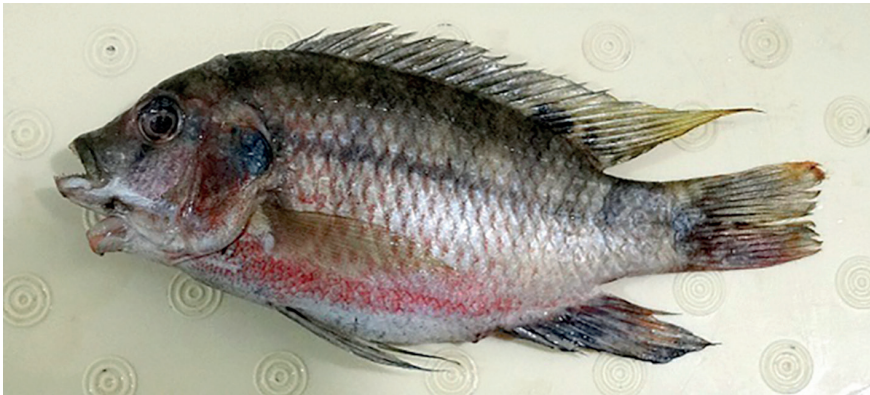
Figure 1. Coptodon zillii , 145 mm TL collected from Shatt Al-Arab River, Basrah, Iraq.

The normal mouth had normal morphology and could be closed, while