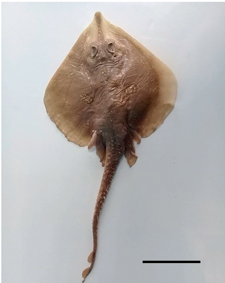
Fig. 2. Leucoraja melitensis collected off the N Tunisian coast. (ref. INSTM Leu-mel 01), scale bar = 50 mm.

The Leucoraja melitensis measured 270 mm TL, 136 mm DW and weighed 80.2 g. It was a juvenile specimen following CAPAPÉ (1977) who noted that size at first sexual maturity occurred between 180 and 220 mm in females from the Tunisian coast (Fig. 2). The specimen was identified with the following