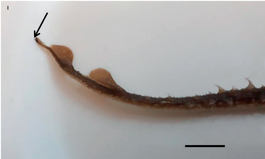
Fig. 3. Tail of Leucoraja melitensis collected off the N Tunisian coast. (ref. INSTM Leu-mel 01), with arrow indicating the lack of caudal fin, replaced by a stump liked structure, scale bar = 20 mm.

combination of characters: disc rounded especially posterior margins, anterior margins very slightly sinuous opposite to spiracles and at level of eyes; snout short and blunt, tip prominent and rounded; mouth arched. Pre-orbital length 23.4%, inter-orbital width 14.7%, all in disc width; total length 1.98 times, disc length 0.82 times, tail length 0.98 times all in disc width.