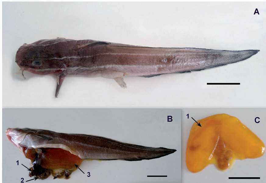
Fig. 2. A. Specimen female of Plotosus lineatus (ref. 2289 M.S.L.) captured off the Syrian coast. scale bar = 20 mm. B. Mature female (ref. 2289 M.S.L.) exhibiting the liver (1), the stomach (2), and the mature ovaries (3). scale bar = 20 mm. C. Mature ovaries removed from the same specimen containing yellow yolked oocytes (1). scale bar = 20mm.

DOGDU et al. , (2016). Such captures suggest that the species is at present successfully established in the Syrian marine waters, and consistent with fishermen and divers who locally sighted schools of the species. Additionally, these four captured specimen were mature females which exhibited large ovaries containing fully yolked oocytes. Some of them were removed from the ovaries and their consistence suggests that they were probably ready to be ovulated (Fig. 2 B, C). Recently, in the wake of local ecological knowledge, Syrian fishermen reported a new capture of 20 specimens of Plotosus lineatus , at least, caught on 07 July 2017 in a single bottom cage, north the city of Latakia by 35°36' N and 35°45' E). Such pattern confirms that the species found favourable environmental conditions to reproduce in Syrian marine waters, and concomitantly, the occurrence of a viable population remains a suitable hypothesis.