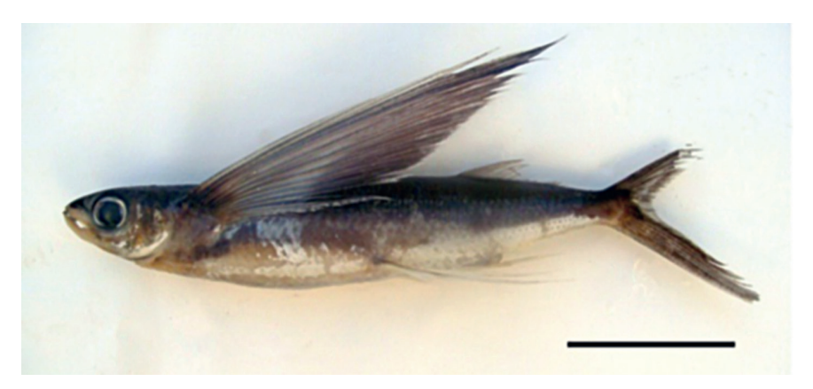
Fig. 2. Cheilopogon heterurus caught off Ras Jebel (Ref. FSB-Che-het-01), scale bar = 90mm.