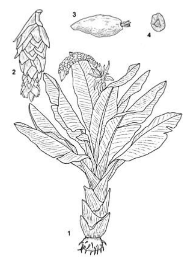
Figure 4 - [Ensete ventricosum (Welw.) Cheesman]. Habit of flowering plant (1); inflorescence (2); fruit (3); seed (4). Redrawn and adapted by M.M. Spitteler