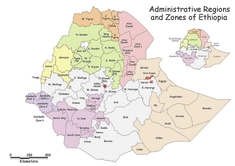
Figure 1 - Map of regions and zones in Ethiopia. All boundaries are approximate and unofficial.

moves from the ground up, is therefore perfectly suited for explaining how the Hadiya farmers approach rules and obligations while at the same time exploiting resources from inside the normative system.