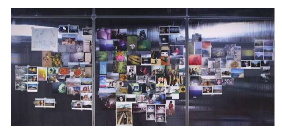
Figure 2 Visual-nonverbal pop-ups in the initial scenes in My Home, in Libya (2018).

These pop-ups are visual-verbal handwritten blocks of text and can include "traditional (sub)titles, but also any other written inserts, banners, letters" (Katan 2018, p. 65). In Caffrey's classification (2009, p. 19), pop-ups are not only verbal titles. He classifies them into four groups to mark the differences between verbal/nonverbal, as well as visual/audio pop-ups. Visual-nonverbal pop-ups are to be understood as nonverbal titles such as images and photos (as Figure 2 shows).