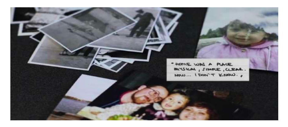
Figure 1 Visual-verbal pop-ups in the initial scenes in My Home, in Libya (2018).

Intertitles are comparable to "pop-up glosses and pop-up notes that explain culturally marked items" (Caffrey 2009, p. x), whereas, in Pérez-González's terms, pop-ups are sub-types of headnotes which are "placed anywhere in the frame to complement the content of standard or dialogue subtitles located at the bottom of the screen" (2014, p. 154). In MHiL , intertitles/pop-ups appear "generally enclosed in small windows on a white background explaining or glossing culturally-marked elements audible or visible in the original" (Perego 2010, p. 53; English trans. by D. Katan 2018), as shown in Figure 1.