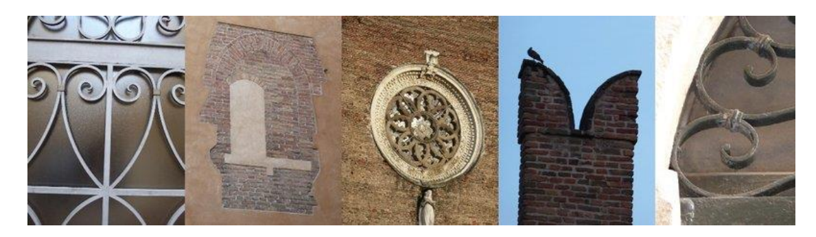
Figure 4 A heart and the word love. Picture by Beachbuddies (TP9).

The visual connection between Verona and romantic love does not only rely on Romeo and Juliet locations or on the representation of other visitors' testimonies. Blogger Beachbuddies represented this link symbolically by creating a picture collage using five different architectural elements - windows, decorations, a rosette, a castle merlon. Put next to one another, the individual elements form the word love preceded by a heart shape, as may be seen in figure 4 below: