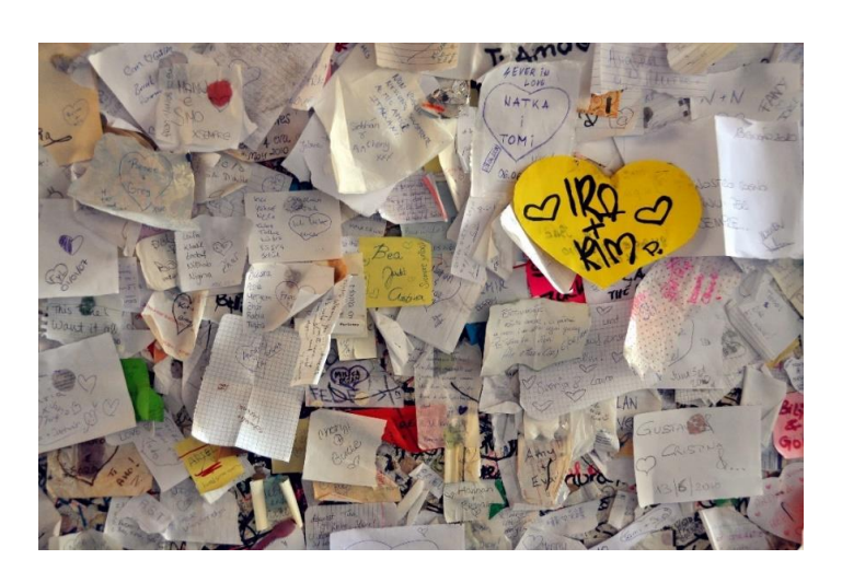
Figure 3 Lovers' names on the wall in Juliet's house. Picture by Deborah Lynn Guber (IN12).

In addition to the balcony and the statue, another popular object of tourist photography is the wall of the entrance that leads from the street to the courtyard where the statue and balcony are located, which is covered by graffiti and pieces of paper – often stuck to the wall with chewing gum - where visitors write their name and that of their lover. In more recent times, couples have started to write their names on colored padlocks and to put them on or in the area around the gate to the courtyard. <sup>12</sup>