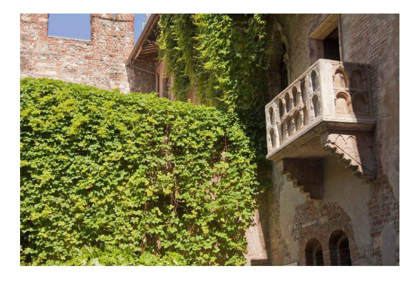
Figure 2 Juliet's balcony.

The statue is sometimes depicted in pictures with a narrative structure, involving an action process (Kress, van Leeuwen 2006, p. 63), with a tourist touching Juliet's statue's breast for good luck in love. This is a tradition that many tourists abide to and that raised curiosity and bewilderment in several bloggers who took pictures of themselves or others performing the action. Here, the tourist has the role of Actor, whereas Juliet's statue, upon which the action is performed, is the Goal (Kress, van Leeuwen 2006, p. 64).