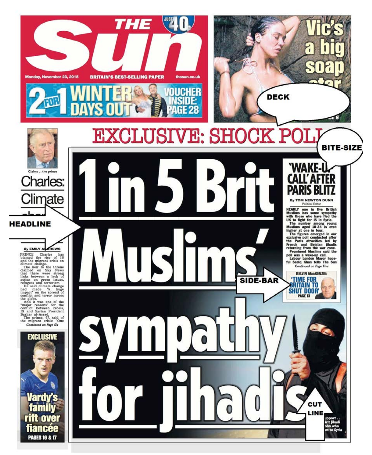
Figure 1 The Sun's © print edition, front page (November 23, 2015).

A close critical discourse analysis of the multimodal text should firstly recognize the complex nature of the artefact, that is made up of several interlaced semiotic components on two different levels that can be categorised as "front page" and "inside the tabloid".