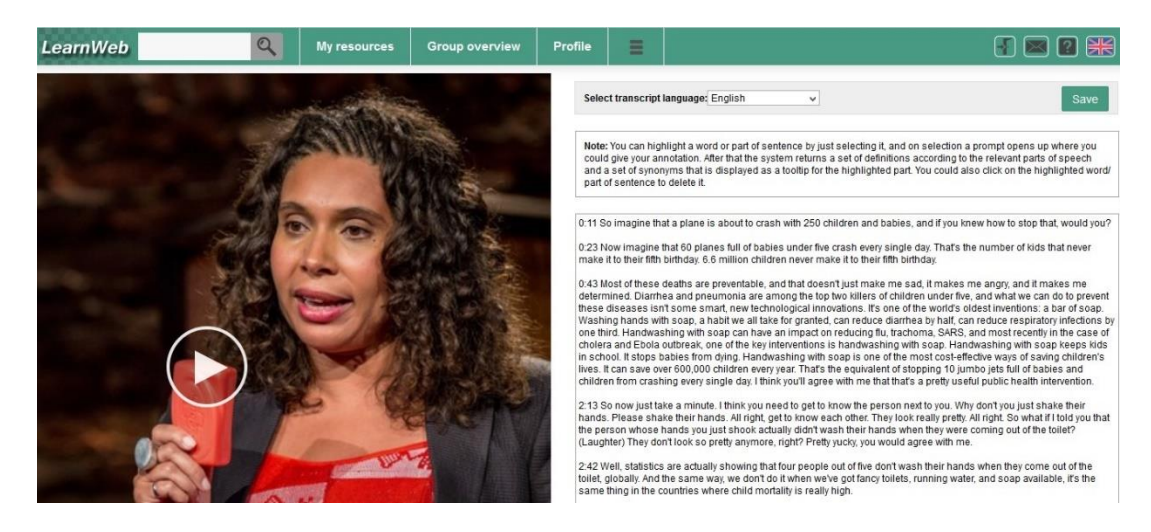
Figure 2 Transcript displayed next to the corresponding video.

LearnWeb allows users to display TED videos and their transcripts in the same window, as shown in Figure 2. Thus, students can watch a video and read its transcript simultaneously. The transcript is preceded by a brief explanation of the interactive features available. The current experiment took advantage of the selection and annotation features only, illustrated in Figure 3.