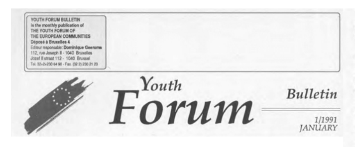
HAEU, YFEC, 41, 01/1984-03/1991, "Youth Forum Bulletin", «Youth Forum Bulletin», 1 (1991), p. 3.