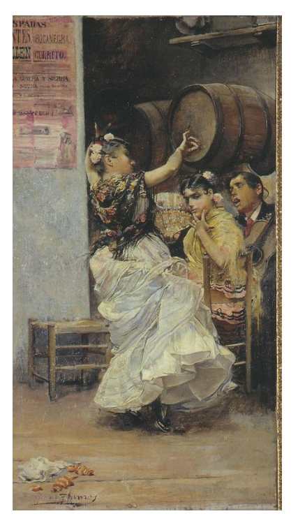
Fig. 2. J. García Ramos, Dancing Bulerías ( Baile por bulerías ), Museum of Fine Arts of Seville, 1884, available at: http://www.museosdeandalucia.es/cultur a/museos/MBASE/