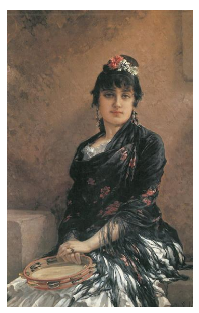
Fig. 5. J. Llovera Buffil, Maja , private collection, available at Flickr:

https://www.flickr.com/photos/76509819@N04/8727211620