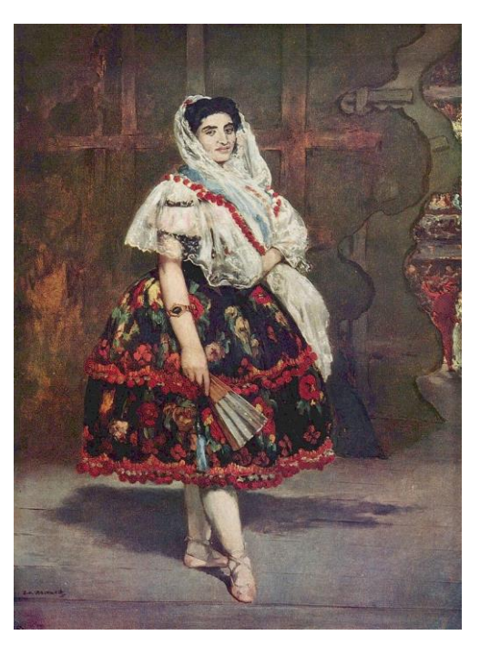
Fig. 1. E. Manet, Lola de Valence. The Yorck Project, 10.000 Meisterwerke der Malerei, Direct-Media Publishing, 2002. In Wikimedia Commons, available at: https://commons.wikimedia.org/wiki/File:Edouar d_Manet_044.jpg