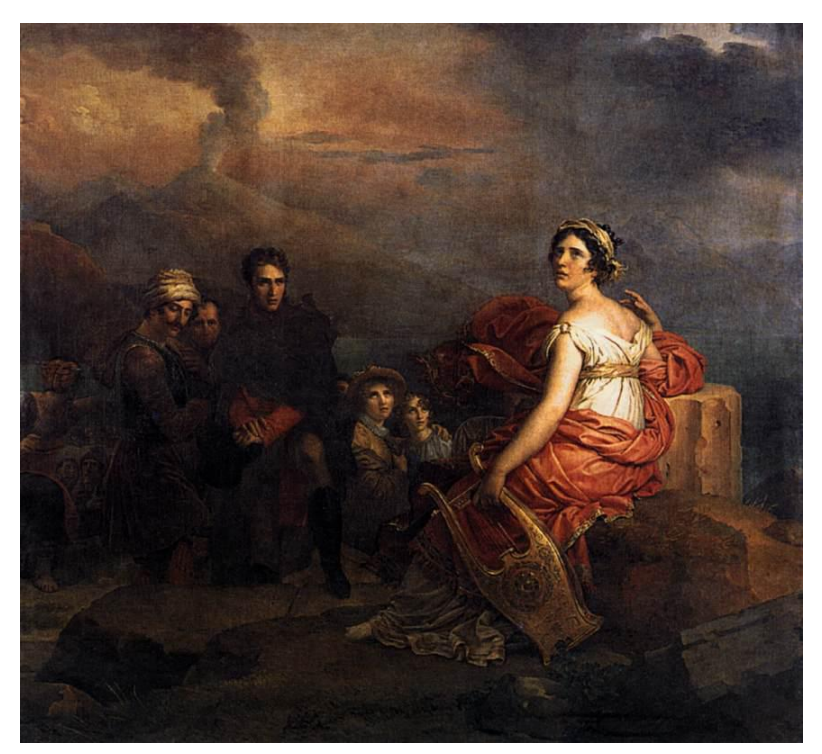
Fig. 5. F. Gérard, Corinne au Cap Misène, oil on canvas, 1819, Lyon, Musée des Beaux Arts.

an illustration of a passage of Madame de Staël's Corinne , where the protagonist is asked by her friends to sing about the memories aroused by Vesuvius and the bay of Naples.