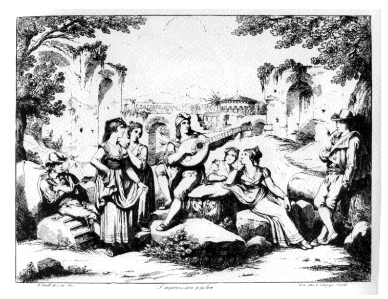
Fig. 17. B. Pinelli, Improvvisatore popolare.

A poet playing a mandola -shaped instrument is in the engraving entitled Improvvisatore popolare [fig. 17],