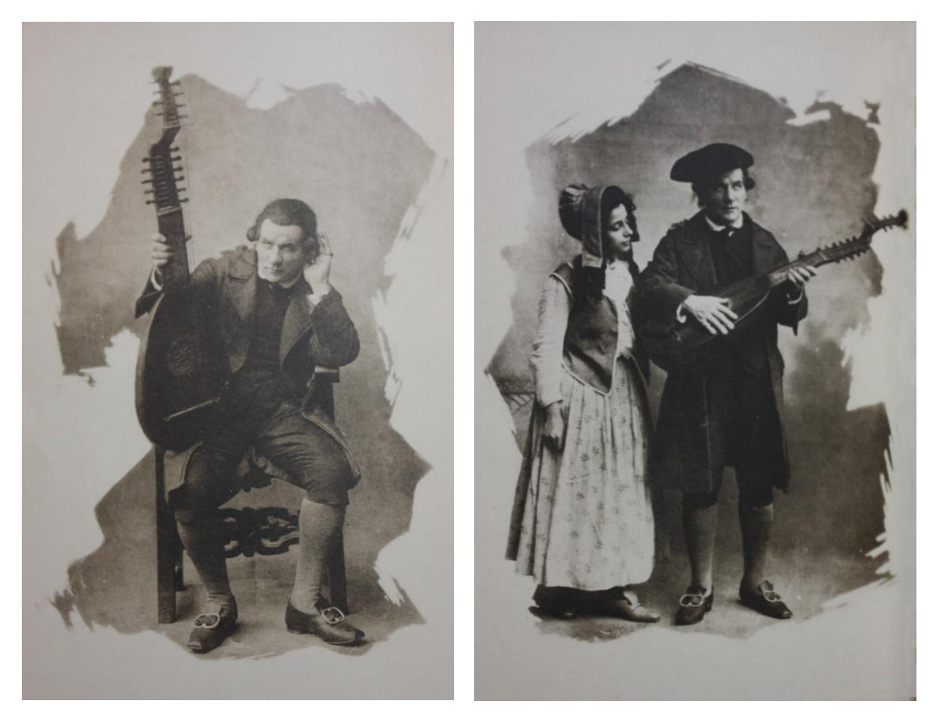
Figs. 23-24. photos from A. ROSTER, Fra le disturne e i canti. Scene della vita di Domenico Somigli detto Beco Sudicio , Firenze, Bemporad, 1910 [1911 in the front cover].