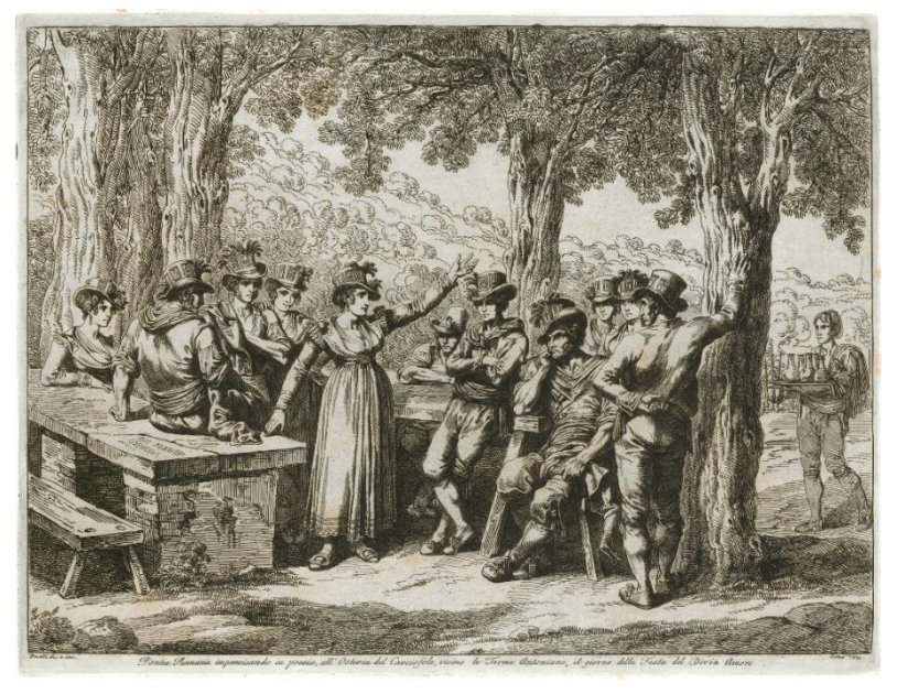
Fig. 20. B. Pinelli, Donna romana improvvisando in poesia all'Osteria del Carciofolo vicino le Terme Antoniane, il giorno della Festa del Divino Amore.