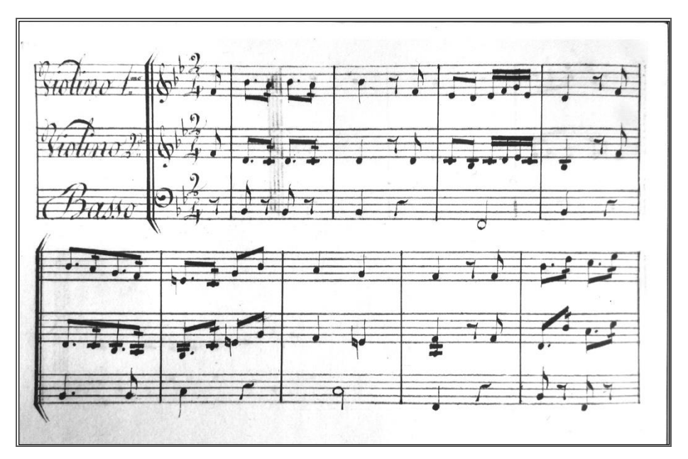
Fig. 10, vedi didascalia fig. 6.