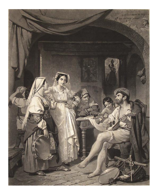
Fig. 14 H. Eichens, L'improvvisatore, acquatint, 1849.

Sometimes, like in Edouard Brandon's paintings of L'improvisateur dans la campagne de Rome now at the Palais des Beaux Arts in Lille [fig. 15],