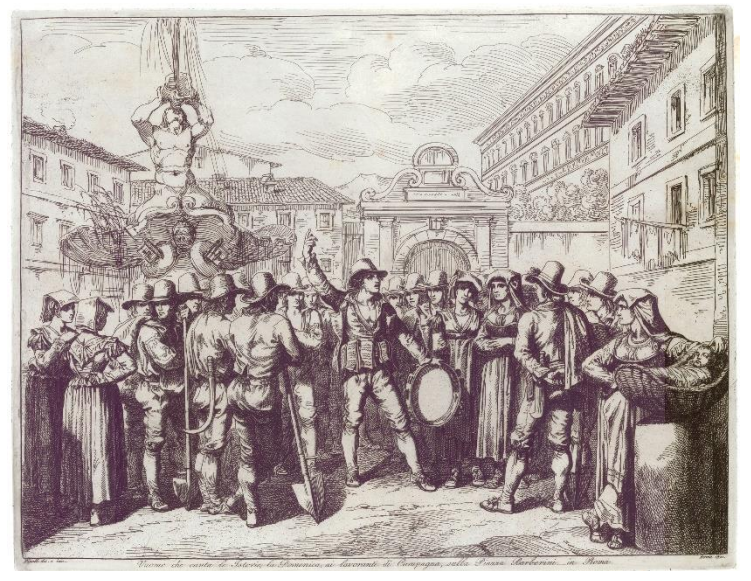
Fig. 18. B. Pinelli, Uomo che canta le istorie, di domenica ai lavoratori di campagna sulla Piazza Barberini in Roma.

where the performance is set in a landscape of ruins, with a small group of people. Here the male improviser is admired by the four women, while two men on the two sides stare at him grimly. We can imagine that here the poetic improvisation has a more private function and involves a love competition. Another engraving by Pinelli shows an improviser singing or reciting without musical accompaniment. Its title is Uomo che canta le istorie, di domenica ai lavoratori di campagna sulla Piazza Barberini in Roma [fig. 18], and it shows an improviser holding a frame drum without playing it. The action of telling stories is connected to the singing of poems of chivalry that I have already mentioned about Naples, or to the habit of performing other stories like Pia de' Tolomei, Francesca da Rimini and many others, mainly in ottava rima , attested by hundreds of sheets and pocket books published throughout the 19<sup>th</sup> century.