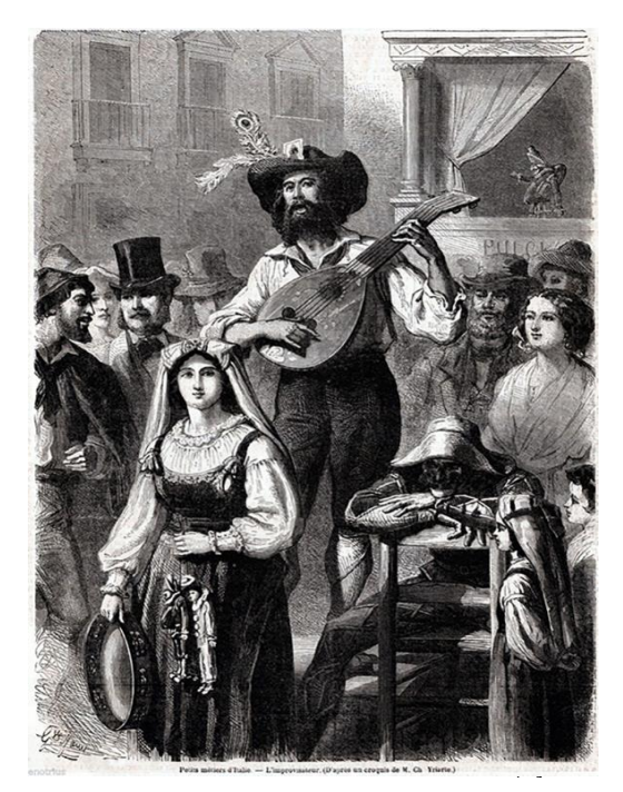
Fig. 16. Petits métiers d'Italie. L'improvisateur (d'après un croquis de M. Charles Yriartes), Paris, Imprimerie Auguste Vallée, 1860 ca.

the mandolin is held, but not played during the performance, by another bystander. This instrument is often mentioned in travel reports describing poetic improvisations, however. both textual and iconographic sources seem not to be systematic in describing the musical accompaniment. The absence of information about accompaniment in some accounts of poetic improvisation and the presence of images (especially from central Italy) where the musical instrument seems to keep silent during the poet's performance seems to suggest that