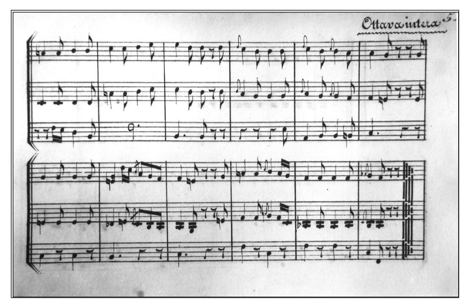
Fig. 9, vedi didascalia fig. 6.