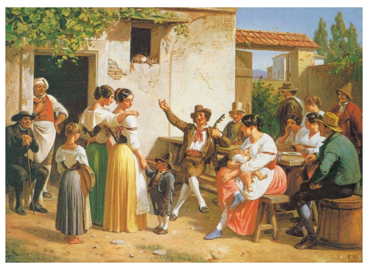
Fig. 13. W. Marstrand, Allegrezza popolare all'osteria, 1853, unknown location.