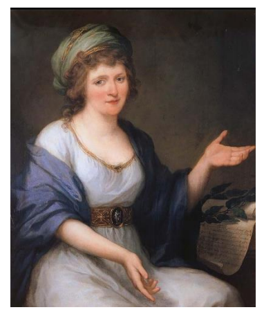
Fig. 3. A. Kauffmann, Fortunata Sulgher Fantastici, oil on canvas, 1792, Firenze, Palazzo Pitti.

Different images of aulic improvisers are now preserved, both on canvas and as engravings in the collections of poems printed by themselves or by listeners and admirers. Apart from a few exceptions they are represented as isolated figures, crowned with laurel, sometimes with arms and hands alluding to gestures, sometimes with a lyre [figs. 3-4].