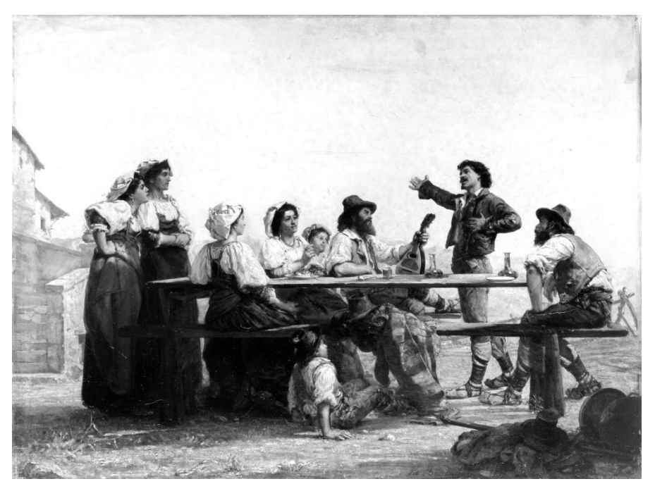
Fig. 15. E. Brandon, L'improvisateur dans la campagne romane, 1831, Lille, Musée des Beaux Arts.