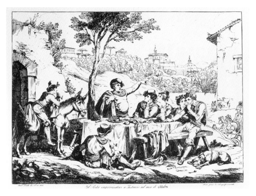
Fig. 19. B. Pinelli, Il poeta improvvisatore al Testaccio nel mese di ottobre.