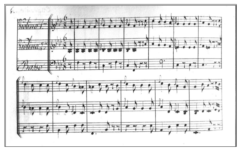
Fig. 8, vedi didascalia fig. 6.