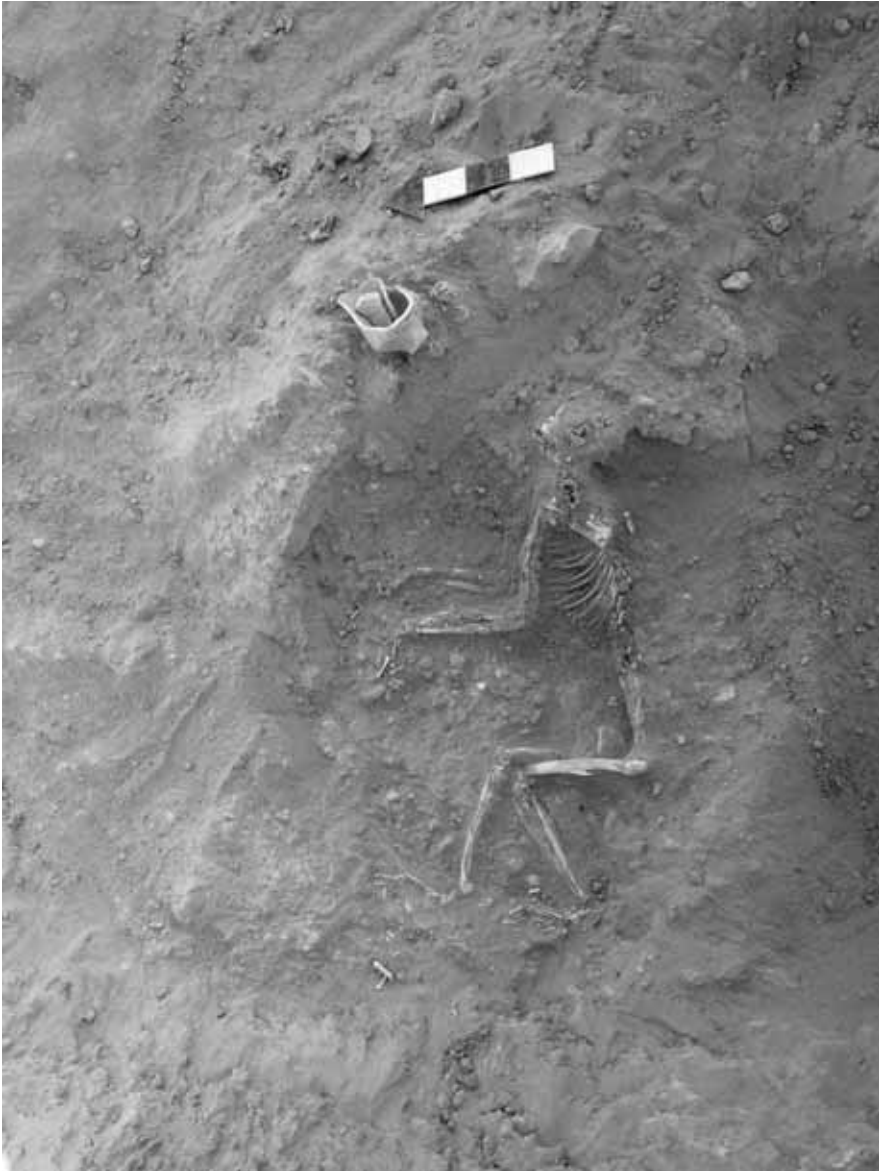
Fig. 2: burial of a rhesus macaque (tomb 9319).