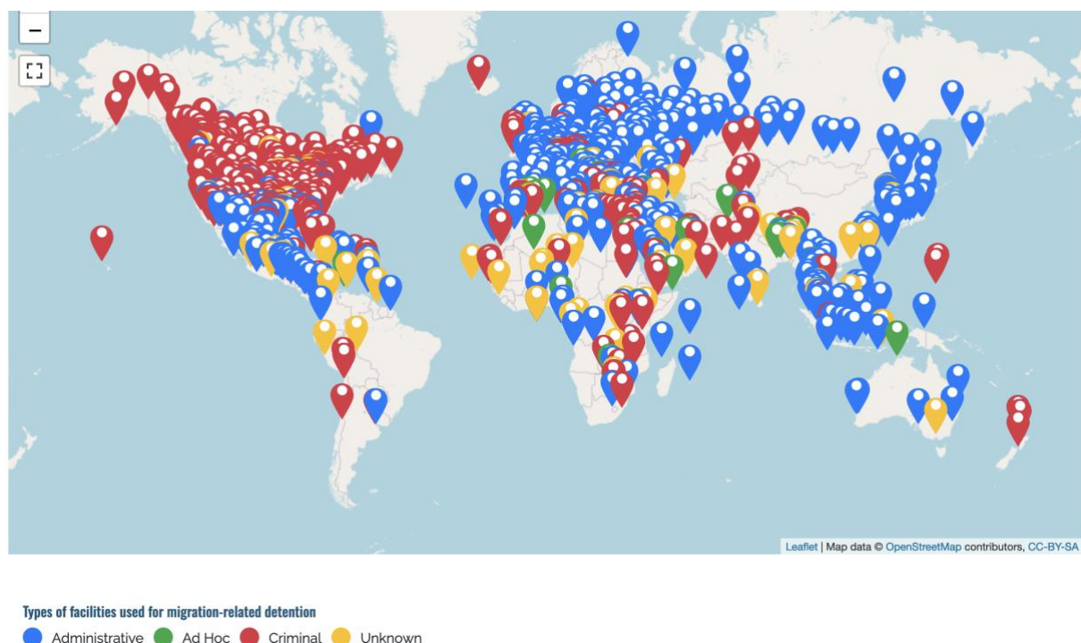
Figure 1. 1604 displayed immigration detention and confinement camps worldwide in 01/2024 (Global Detention Project, 2024)

What is the relationship between migration detention and torture? Little is known of further relations: Is detention itself a detrimental factor for the detainees' mental health, which interacts with the survival of prior torture? To what degree do the detention conditions or the treatment by the detention center's staff affect the mental health outcomes of detainees? Are torture survivors 'merely' detained in migration detention, or does migration detention 'produce' torture survivors?