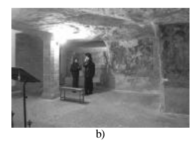
Figure 1. Byzantine Crypt, a) two outside entrances, b) interior located underground.