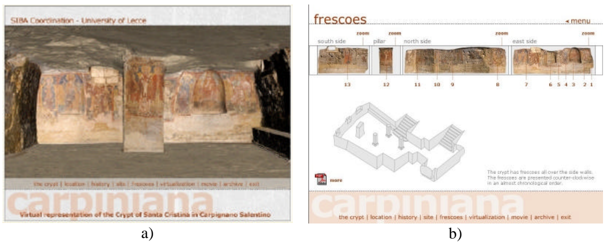
Figure 3 CDROM: a) entrance page, b) use of orthophotos generated from 3D model to navigate through the frescoes.