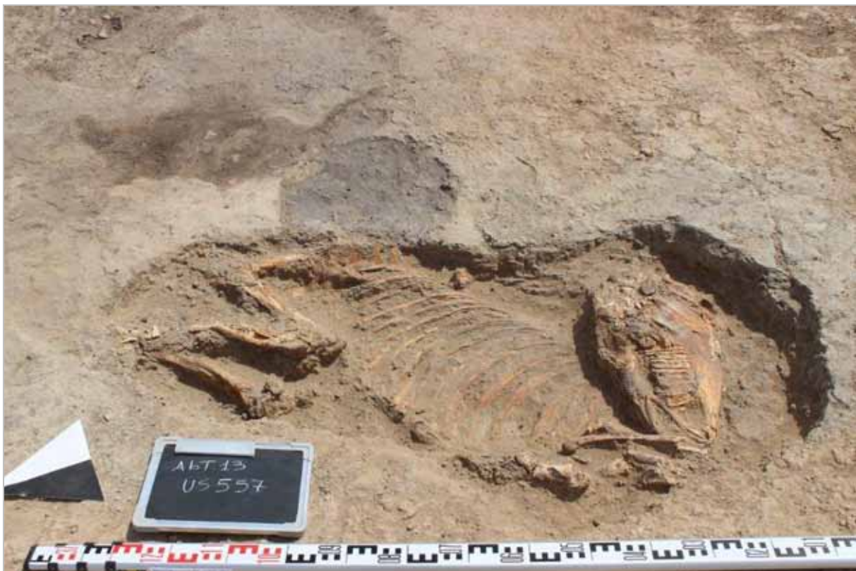
Fig. 2. The equid burial of Abu Tbeirah.