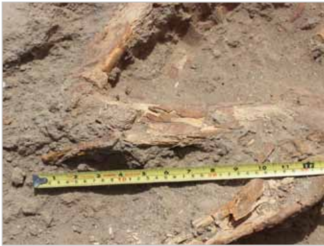
Fig. 3. Detail of the hind limb (note the poor preservation condition of the bones).